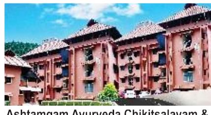
Ashtangam Ayurveda Chikitsalayam & Vidyapeedham (AACV), Vavanoor