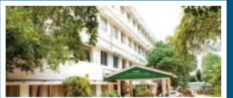
Santhigiri Siddha Medical College, Thiruvananthapuram