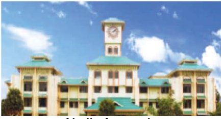
Ahalia Ayurveda Medical College Hospital, Palakkad