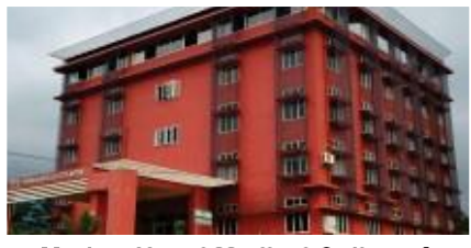
Markaz Unani Medical College & Hospital, Kozhikode