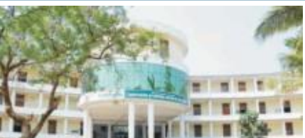
Santhigiri Ayurveda Medical College, Palakkad