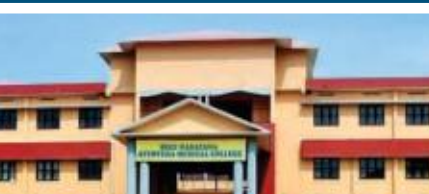
Sree Narayana Institute of Ayurvedic Studies & Research, Puthur, Kollam