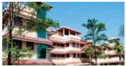
Mannam Ayurveda Co-operative Medical College, Pandalam