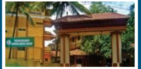
MVR Ayurveda Medical College Parassinikadavu, Kannur