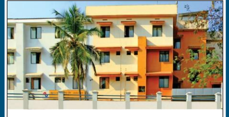
KMCT Ayurveda Medical College, Calicut