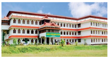
Nangelil Ayurveda Medical College, Kothamangalam