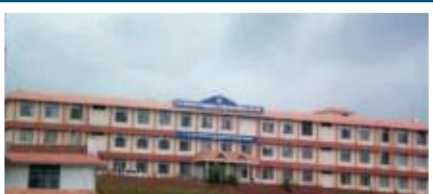
P.N.Panicker Souhruda Ayurveda Medical College, Kasargod