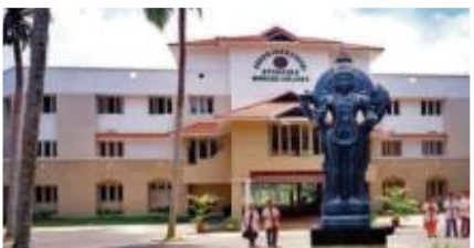
Pankajakasthuri Medical College, Thiruvananthapuram