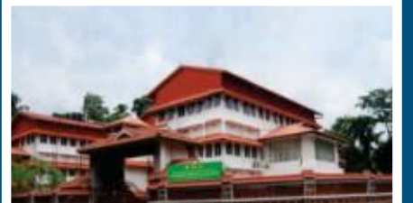
P.N.N.M Ayurveda Medical College, Shoranur